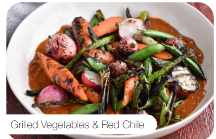
Grilled Vegetables & Red Chile