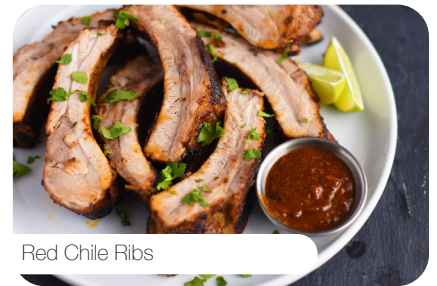
Red Chile Ribs